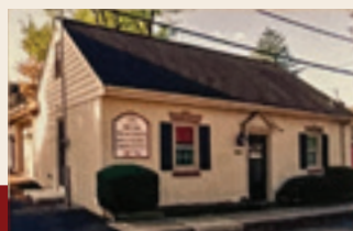
The Callahan Research Center 100 Mercer Street Newtown, PA 18940