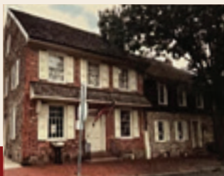
Half Moon Inn 105 Court Street Newtown, PA 18940