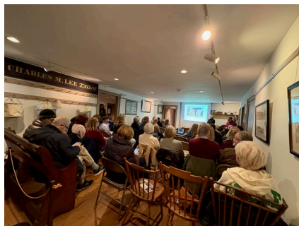
November General Meeting

It was a full room. Approximately 50 people were in attendance.